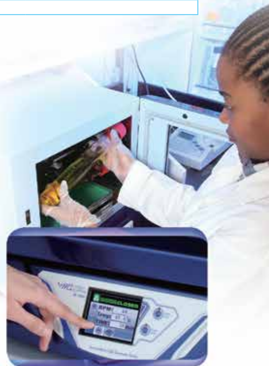
Touch screen & graphical control interface