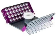
SR-64 BS-010201-EK rotor

Rotor for 2 x 8-section 0,2 ml microtube strips