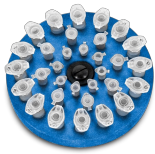
PV-32 BS-010207-CK platform

V-32 is supplied with a 32-socket universal platform for Eppendorf type tubes up to 1.5 ml (1.5/0.5/0.2 ml — 16/8/8 sockets) PV-32 and PL-1 platform for mixing single tube up to 50 ml.