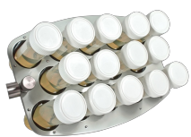
PRS-14 BS-010118-BK platform

14 tubes 20-30 mm diameter (50 ml tubes).