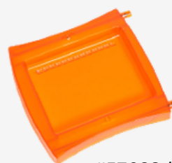
#57023 / 57031