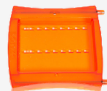
#57029 / 57032