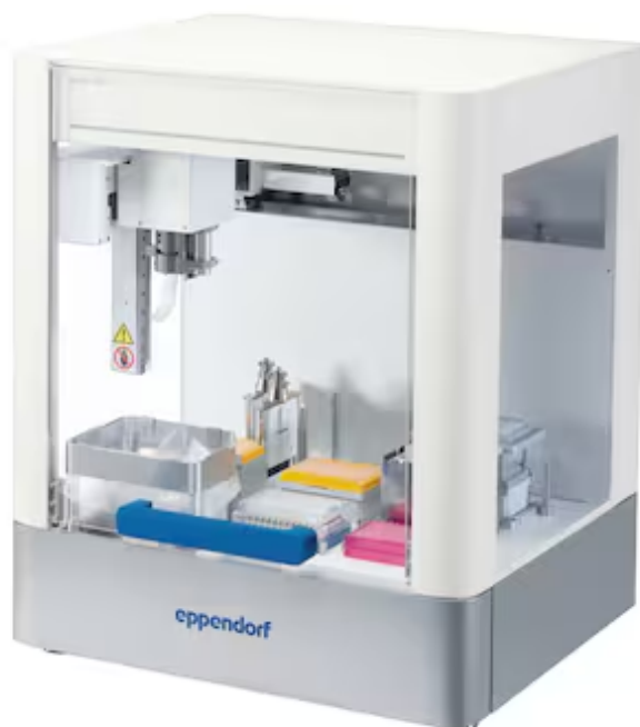
epMotion 5073: 1-24 samples